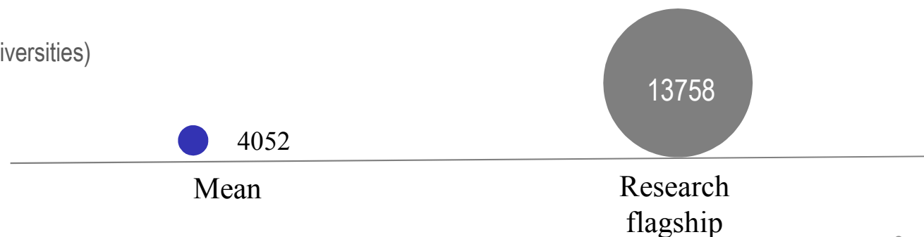
Average size of HEIs (number of full-time students)

35 leading universities from 250 = 43% of the total funding of universities under the control of MOES